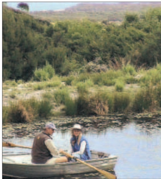
Just dreamy: A secluded Flinders Island beach (above), rowers enjoy a peaceful lagoon and relaxing in the spa at Healing Dreams Retreat.

The tour, for groups of four to 15 on a twin share basis, is valid until